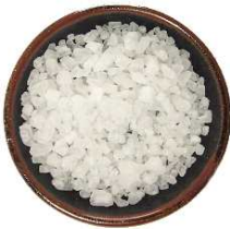
salt for sidewalk